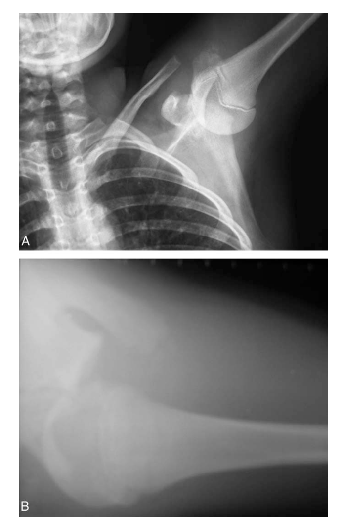
FIGURE 2. Prereduction plain shoulder radiographs from the 13-year-old patient in the first case report. A, Anteroposterior view, inferior dislocation of the humeral head. B, Axillary view, humeral head positioned in the posterior aspect of the glenoid.

cular examination did not change from the prereduction examination.