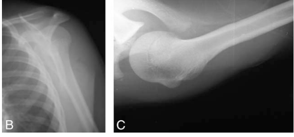
FIGURE 3. Postreduction plain shoulder radiographs from the 13-year-old patient in the first case report. A, Anteroposterior view, reduction of the humeral head in the glenohumeral joint. B, Scapular-Y view, humeral head centered in the glenoid. C, Axillary view, humeral head located in glenoid without evidence of head depression.

injuries difficult to close reduce. On rare occasions, the humeral head may rupture the inferior capsule preventing closed reduction, and the injury may be severe enough to create an open inferior glenohumeral dislocation.<sup>5</sup> In a recent case report, arthroscopy before reduction of inferior glenohumeral dislocation demonstrated detachment of the superior labral anterior posterior complex (SLAP), which extended to the anteroinferior portion of the glenoid labrum.<sup>6</sup> The authors performed open reduction of the greater tuberosity fragment followed by arthroscopic labral repair with 3 suture anchors.<sup>6</sup> The patient had full shoulder range of motion and return to baseline sports activity by 9 months after surgery. This case report may demonstrate the extent of injury involved in inferior shoulder dislocations especially in comparison to anterior dislocations. Although anterior shoulder dislocations involve Bankart (or bony Bankart) lesions, the inferior shoulder dislocations may involve injury to the SLAP complex that extends to the anteroinferior aspect (Bankart) of the labrum. The authors hypothesize that such an extensive injury to the glenoid labrum may explain why conversion from inferior to anterior shoulder dislocations is possible, and also illustrates the extent of injury to shoulder stabilizers that likely occurs from the initial injury.