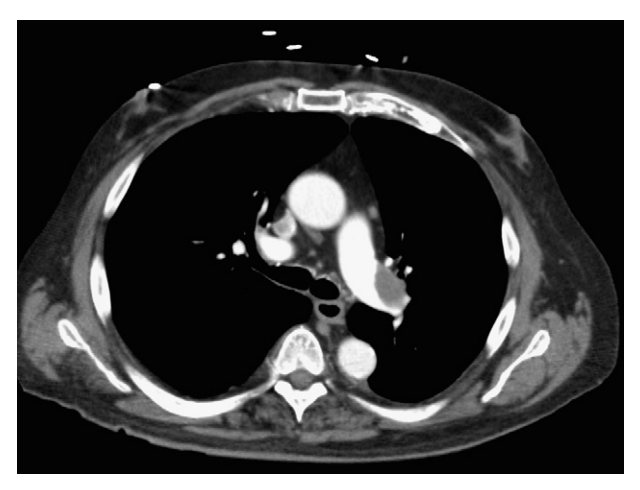
Figure 1. Representative example of computed tomographic angiogram demonstrating >90% stenosis of distal left main pulmonary artery by acute PE.

radiologic findings were performed by radiologists not participating in the study. To be eligible for enrollment, the patients were required to have a minimum of \geq 2 new signs and symptoms consisting of chest pain, tachypnea (respiratory rate at rest >22 breaths/min), tachycardia (heart rate at rest ≥90 beats/min), dyspnea, cough, oxygen desaturation (oxygen partial pressure <95%) or elevated jugular venous pressure ≥12 cm H<sub>2</sub>O. RV enlargement or hypokinesia and elevation of biomarkers of RV injury (troponin I and brain natriuretic peptide), although measured, were not a requirement for enrollment. The exclusion criteria included an onset of symptoms >10 days; >8 hours since the start of parenteral anticoagulation; systemic arterial systolic blood pressure <95 or \geq 200/100 mm Hg; eligibility for full-dose thrombolysis; a contraindication to unfractionated or low-molecular-weight heparin; severe thrombocytopenia (platelet count <50,000/mm<sup>3</sup>); major bleeding within <2 months requiring transfusion; surgery or major trauma within <2 weeks; brain mass; neurologic surgery, intracerebral hemorrhage, or subdural hematoma within <1 year; end-stage illness with no plan for PE treatment; and an inability to perform echocardiography because of chest deformities, bandages, or catheters.